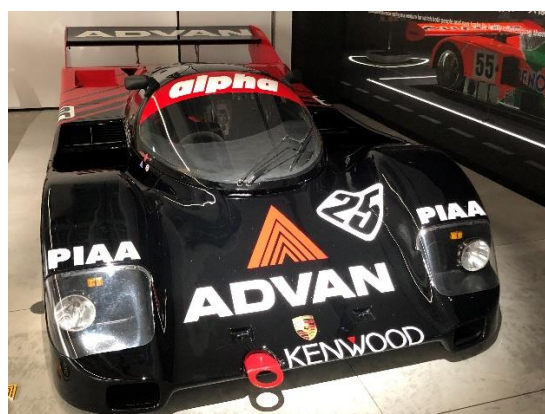
④ Porsche 962C