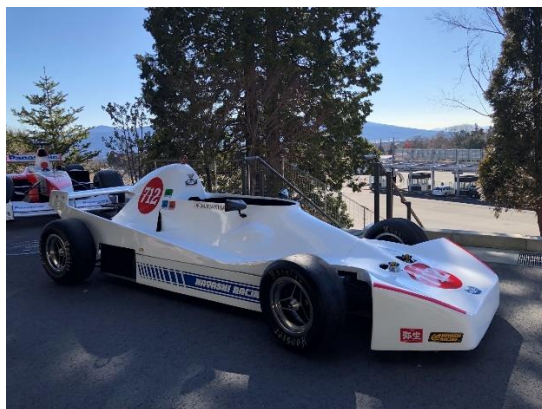
①FL500 Hayashi 712