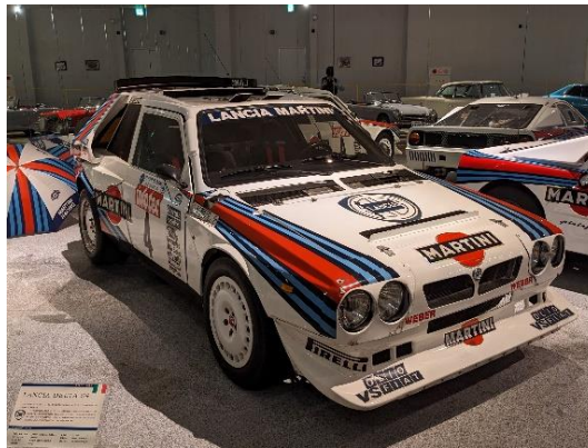
Lancia Delta S4 (1986) <Photographed at the Shikoku Automobile Museum>

A midship 4WD vehicle for the WRC, appearing at the end of the 1985 season, conforming to Group B regulations. It featured a steel tube spaceframe chassis with body panels extensively using lightweight materials like carbon Kevlar and titanium. The engine, with a displacement of 1,759cc, was equipped with both a supercharger and a turbocharger, initially producing 450 horsepower and eventually reaching up to 600 horsepower, making it a monster machine. Although it debuted with a win, the Group B rally, due to its immense power, led to numerous accidents causing injuries and fatalities among drivers, co-drivers, and even spectators. Consequently, it was discontinued after 1986.